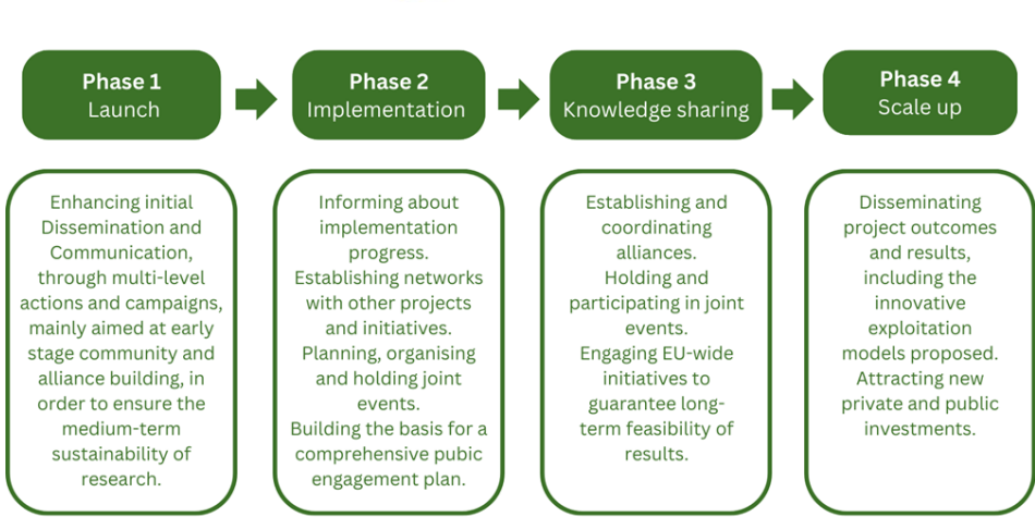
Figure 3: K-HEALTHinAIR Dissemination & Communication timeline.