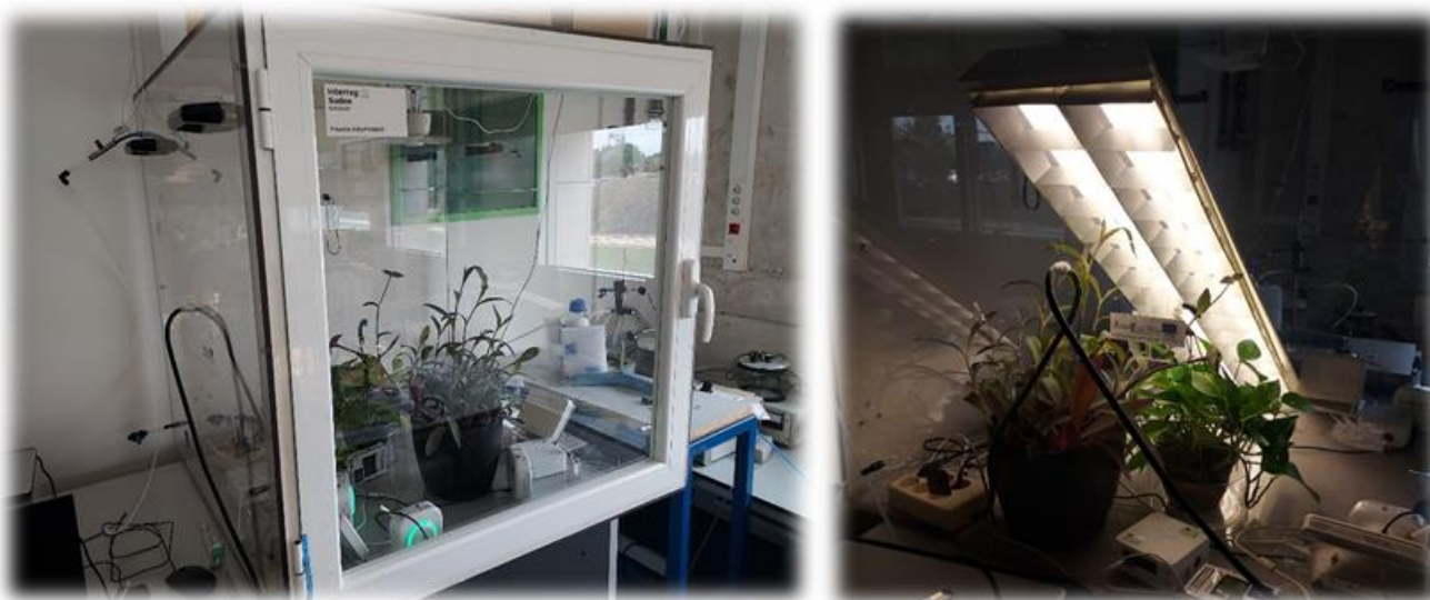
Image 1. 1 m 3 experimental chamber with the plants inside. Test performed without (left) and with (right) additional illumination.

For this experiment, we took two of the plants 2 we have at our offices in CARTIF and placed them in our airtight chamber (see Image 1). In a first experiment, we placed the plants in the laboratory without additional lighting. Lighting inside the chamber is insufficient for proper plants development. Then, we place additionally lighting inside the chamber as it can be seen in the image 1.